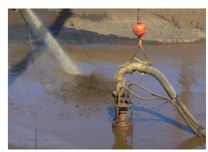
Hydraulic Power Packs &Submersible Pumps