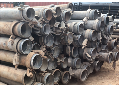
QD Piping, HDPE Piping, Hoses, & Fittings