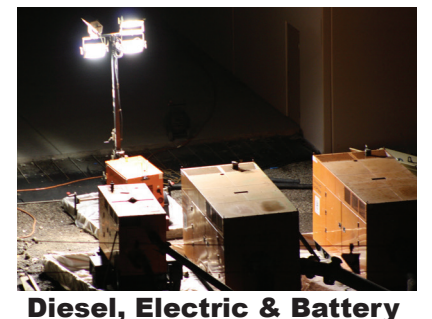
Powered Light Towers