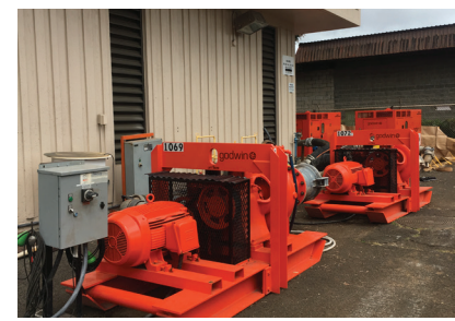
Electric Dri-Prime & Submersible Pumps