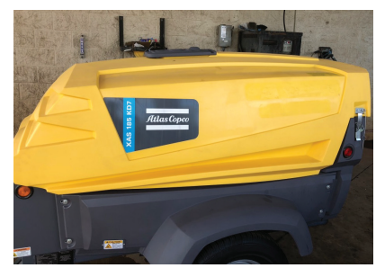
Portable & Industrial Air Compressors