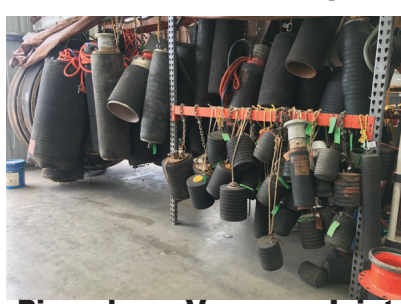
Pipe plugs, Vacuum, Joint & Mandrel Testers