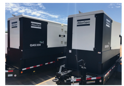
Portable & Standby Generators